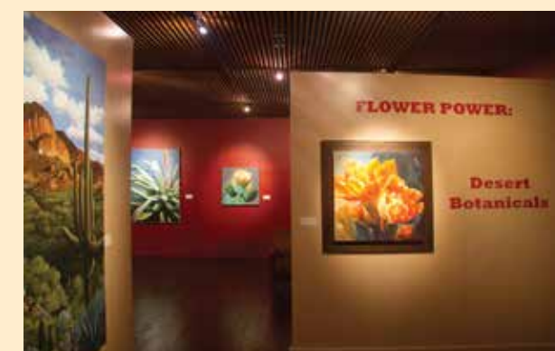
Flower Power: Desert Botanicals exhibition

With more than 200 paintings, drawings and sculptures created by women artists, the 15th annual Cowgirl Up! exhibition and sale embraces the full spectrum of Western American art today.