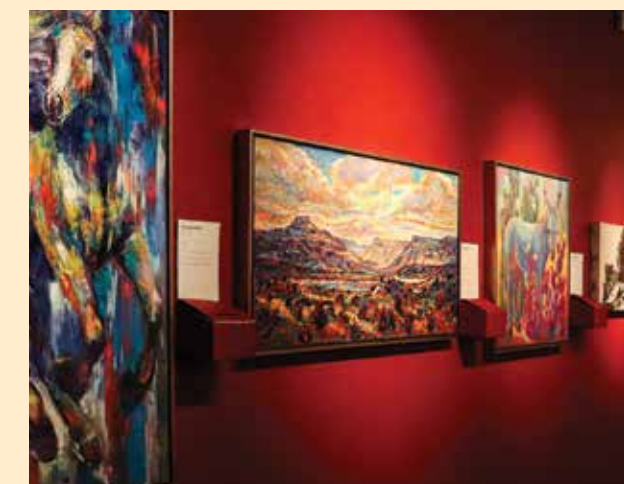
Cowgirl Up! exhibition

The ninth annual community-curated exhibition features work in several mediums.