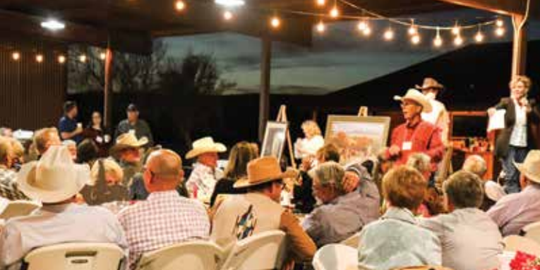
Boyd Ranch benefit

Members enjoy many benefits including free admission, special events and Smithsonian discounts. Please visit westernmuseum.org to join or renew!